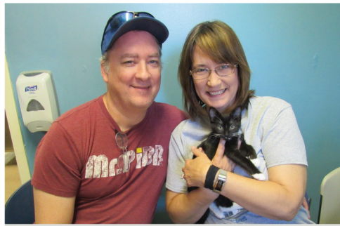
Tonks, adopted in May