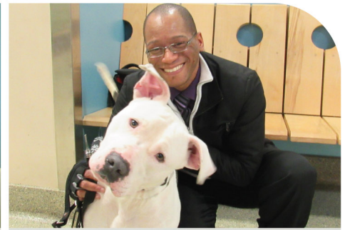
Rollo, adopted in January