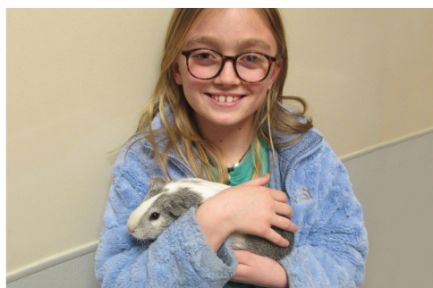
Lynx, adopted in March