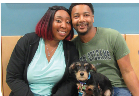
Charger, adopted in May