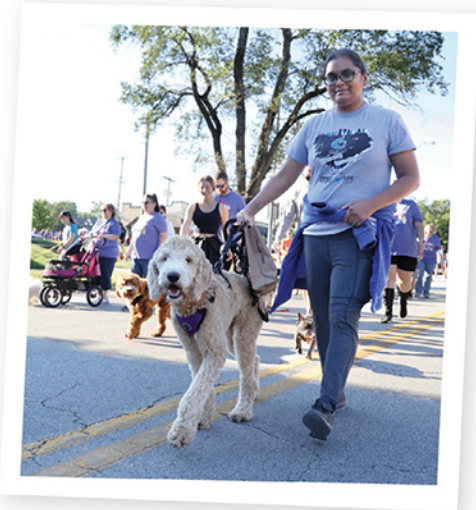
PICTURED ABOVE: A walker enjoying the beautiful morning with her dog to raise money for the homeless animals.

Melcher Investment Company, Rob Sight Ford, Ameristar Cares, Hill's Science Diet, Demdaco, Dechra Veterinary Products, Landers' Visions, JNA Advertising, Lily's Play N Stay, JE Dunn, Camp Bow Wow, Noah's Ark, Mission Driven, On The Ball, Westlake Hardware, 99.7 The Point, The Kansas City Star, and KMBC Channel 9!