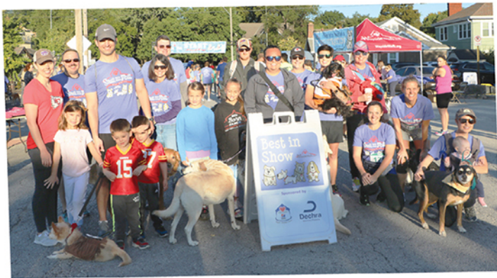
PICTURED ABOVE: Team Dechra - employees participated that day and the company sponsored the event.

Big tail wags to everyone who participated in the 32nd Annual Strutt With Your Mutt on Sunday, September 25. Whether you ran, Strutted, volunteered, or donated, your generosity raised funds to rescue and care for the homeless animals at Wayside Waifs.