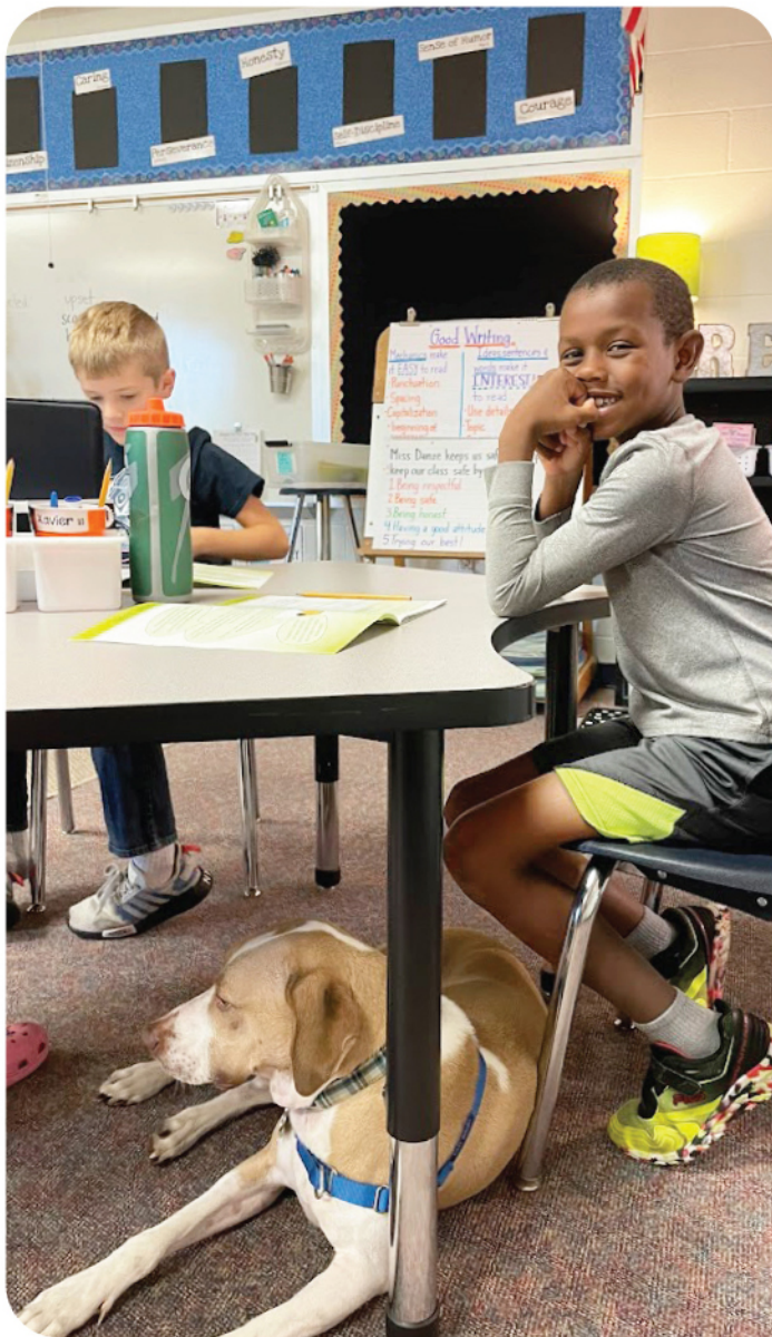
PICTURED ABOVE: Brody is a Companion Animal who helps teach No More Bullying!

Brody had been transferred to Wayside because the shelter where he was living had run out of space and could no longer care for him. Upon arrival, our medical team examined him and discovered he had Heartworms – a potentially deadly disease when left untreated.