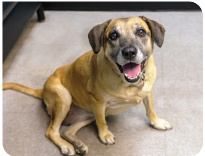
PICTURED ABOVE: Baby Jane received a second chance thanks to donor support.

These two homeless animals, along with thousands of others, are cared for every year at Wayside. Thanks to you and The Fenby Fund, we're able to care for our most sick and injured animals. We're very grateful to everyone who donates to The Fenby Fund to ensure the animals get the care they deserve.