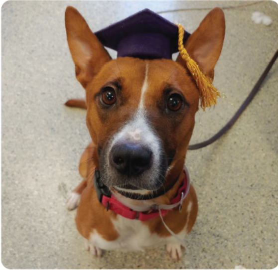
PICTURED ABOVE: Princess Buttercup graduated from our Food Modification Program thanks to our Behavior Team.

Purr Gamma Bark is a fun, exciting, and inclusive group comprised of women who are passionate about making a difference in the lives of pets and people in our community. PGB supports the shelter financially and by expanding awareness. Currently, PGB membership dues fund our life-saving Behavior Modification Program. Our highly trained Behavior Team works tirelessly helping dogs who, through no fault of their own, need behavior modification prior to being adopted. They provide customized care to ensure dogs live happy lives.