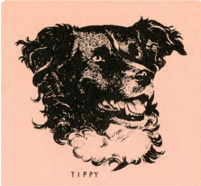
Tippy, one of the original mascots in Wayside's newsletter from 1948, "Tippy Speaking."

While Wayside's location has been the same for the past 75 years, the land we are on has grown to 50 acres. What started as a house-like shelter on farm land is now much more. We have our modern-day building, Bark Park, Pet Memorial Services (including the building and cemetery), an agility park, and luscious green space with walking trails. The building has had additions over time – increasing its size to the 47,000 square foot, state-of-the-art facility it is today. And you can look forward to upcoming groundbreaking that will add a new Canine Behavior Center and an expansion of the current building making room for an Education and Training Center.