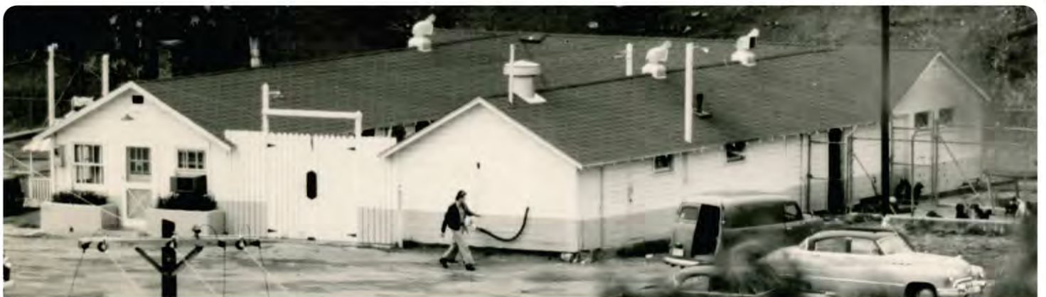
The Wayside Waifs building in October, 1955 – a lot has changed since then.

“It is highly important that the education of the ‘heart’ go hand-in-hand with the education of the ‘mind’ if there is to be a better world.”– words written by original Wayside staff about Humane Education