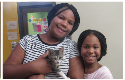
Fire Opal, adopted in August