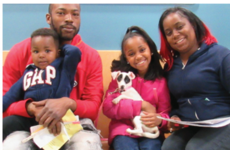
Firefly, adopted in April