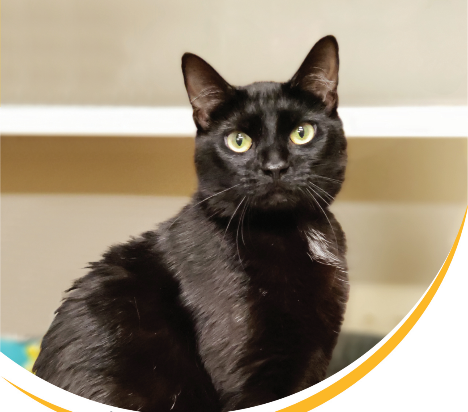
Claudia, adopted in November