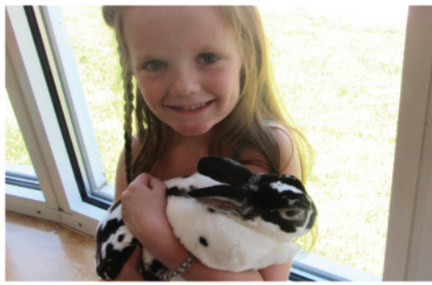
B-Hops, adopted in July