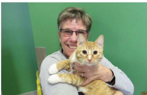
Harley, adopted in February