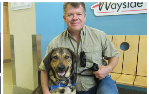
Bosco, adopted in July